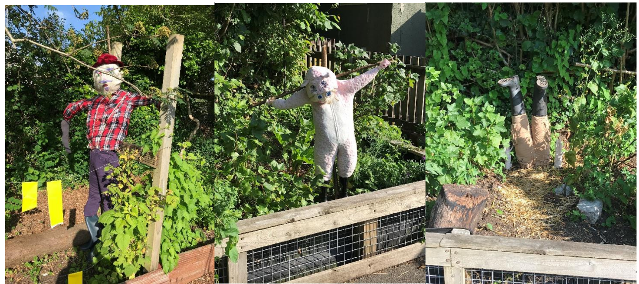
SAFE, RESPECTED AND READY TO STEP OUT INTO THE WORLD